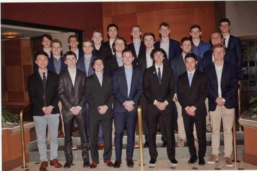
Class of 2017 Senior Sendoff